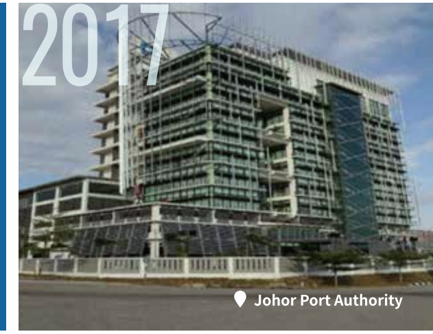
📍 Johor Port Authority