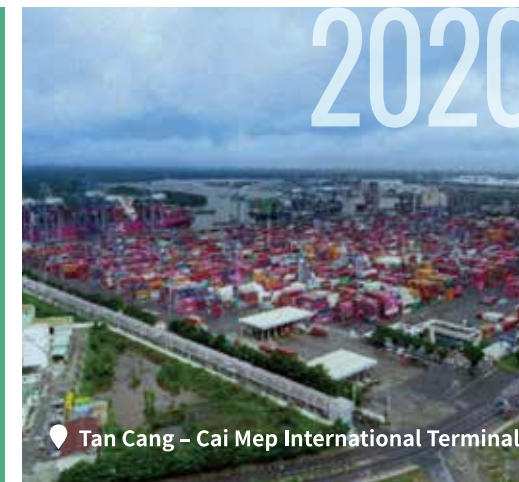
📍 Tan Cang – Cai Mep International Terminal