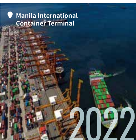
📍 Manila International Container Terminal