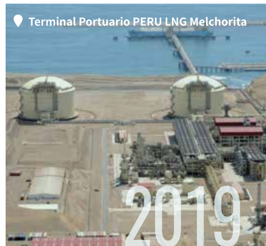
📍 Terminal Portuario PERU LNG Melchorita