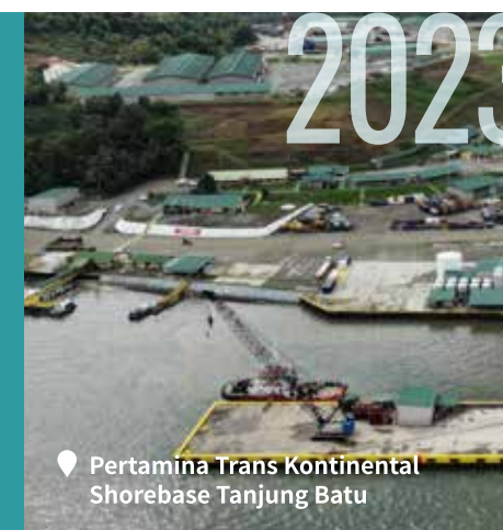
📍 Pertamina Trans Kontinental Shorebase Tanjung Batu